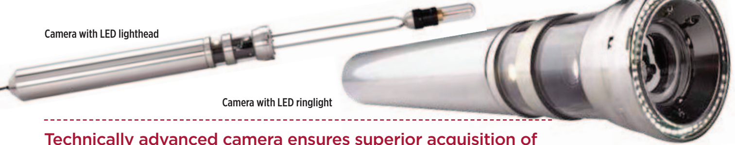
Camera with LED ringlight